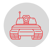
Defence & Military